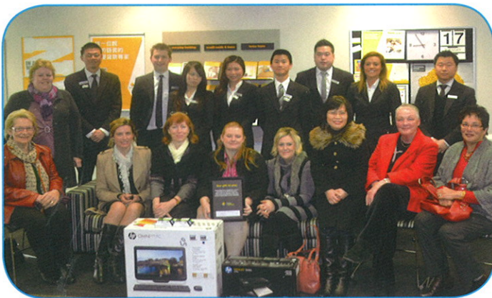
Helping to celebrate 100 years of service, the Eastwood Commonwealth Bank donated a computer and printer to CCA