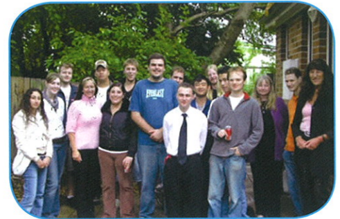
The Shack is a meeting place for young people

The Shack is a safe, supervised meeting place for young people from Epping and surrounding areas where they can interact with others, enjoy social and recreational activities. The Shack operates as a drop-in centre for young people and their families, free from drugs and alcohol, providing referrals, social activities, counselling and case work. Workshops are held on issues relating to drugs, alcohol, computers, health, fitness and other relevant topics. Much needed practical assistance in the form of food and clothing is also provided.