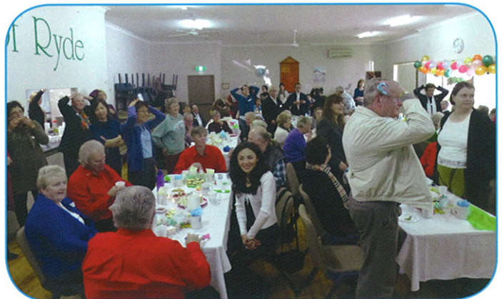
The annual Volunteers Thank You event brought together over 100 volunteers to enjoy refreshments and lively entertainment