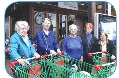
The bus shopping program enables seniors to undertake their own shopping