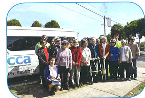
Chinese Bus Outings are a combination of sightseeing and lunching