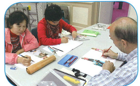
Students perfect their skills through the Leisure Learning program