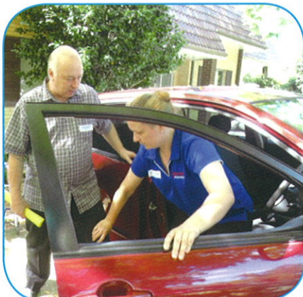
Volunteers receive training from qualified instructors