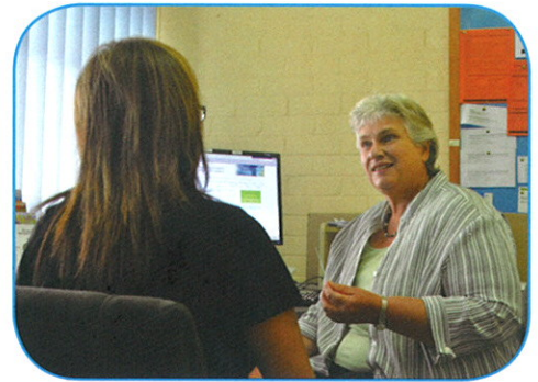
Financial Counselling is a free service

The past year has seen Family Day Care undertake the final steps towards being fully integrated within the national Education and Care Services system that includes all types of early childhood services, long daycare, preschool and out of school care. Educators working in the Scheme are required to be qualified as Early Childhood practitioners. There is a clear emphasis on planning experiences for children to help them achieve the learning outcomes reflected in the Early Years Learning Framework. These outcomes are supporting children to become confident, involved learners and communicators with an awareness of themselves, their wellbeing and their connections to the greater community. The Scheme's newly revised Philosophy not only supports these outcomes, but also supports continuing partnerships with families, the community and support agencies. Through this the child's family is acknowledged as being their first and foremost important teachers. The compliance and assessment visit under the new system is scheduled sometime during late 2012.