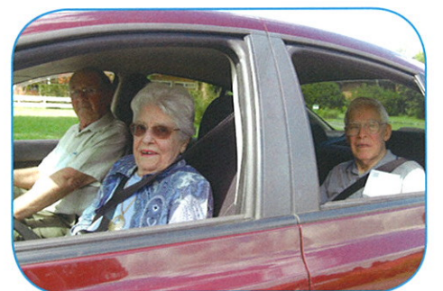
Volunteers provide an invaluable Transport Service

Every day transport is organised for clients to attend a range of health related appointments with doctors and specialists, dentists and optometrists, hospitals and clinics. When drivers are available transport is also offered for clients to attend additional non health related appointments such as the hairdresser, the bank or to visit family members in nursing homes. This service is made possible through the generosity of volunteer drivers.