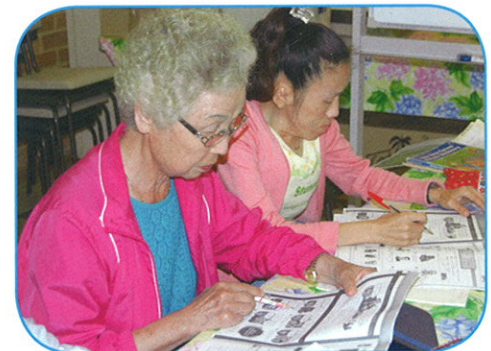
The English Conversation classes helps students improve their language skills

For those unable to travel on the shopping bus, arrangements can be made for a volunteer to collect the client from their home and assist them to shop. Those that are housebound volunteers are available to shop for them. The third option is phoning through a shopping list and a staff member will order the required items from Coles. You must be home for the delivery. CCA does not charge for this service however, the Coles delivery charges do apply.