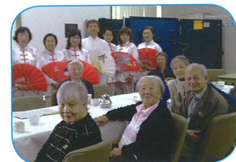
The Cantonese Lunch Group meet fortnightly