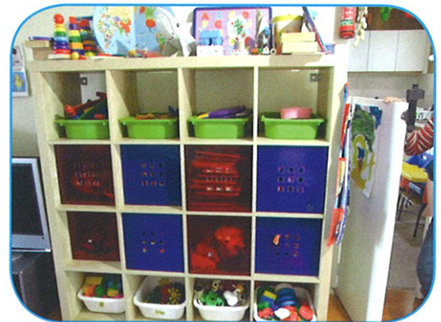
Inside a Family Day Care Educator's house