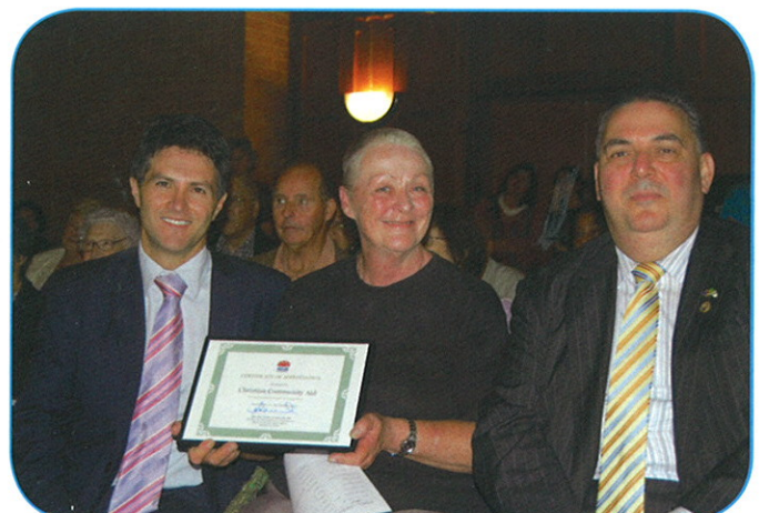
CCA receives a "Continuing Support of Seniors Week" certificate