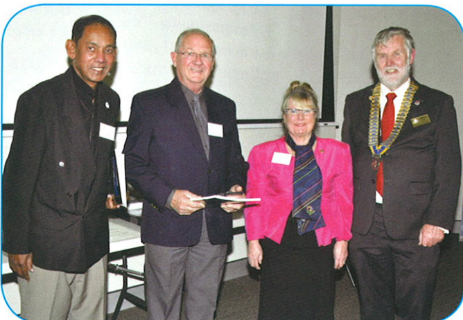
Volunteers receive the "Medical Transport Drivers" award from Rotary