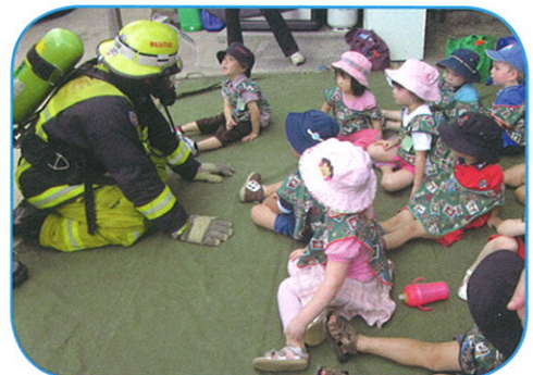
Children enjoy an excursion to the Fire Station