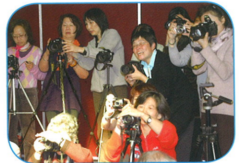
Students enjoy photography classes at the Chinese Leisure Learning Centre

English conversation classes are held at Macquarie Park.