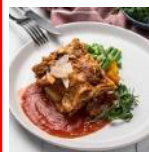
Beef Ragu Lasagne

Contact us on 9858 3222 for the full menu.