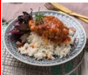
Sittee's Lebanese Chicken with Rice