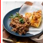
BBQ Pulled Pork with Potato Gratin