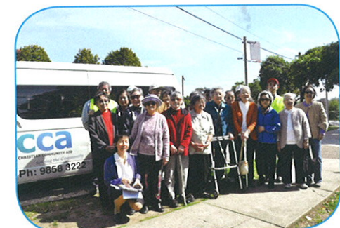
Chinese Bus Outings are a combination of sightseeing and lunching