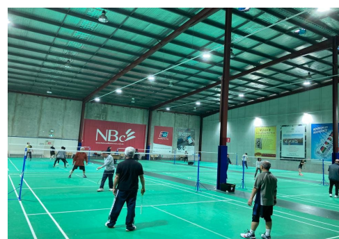
Badminton Fun Day (羽毛球同樂日)