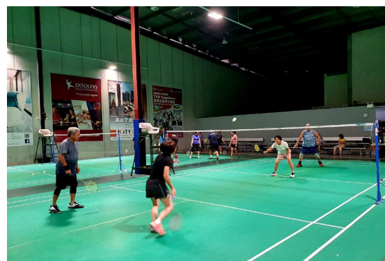
Badminton skill training with tutors (羽毛球技巧訓練)